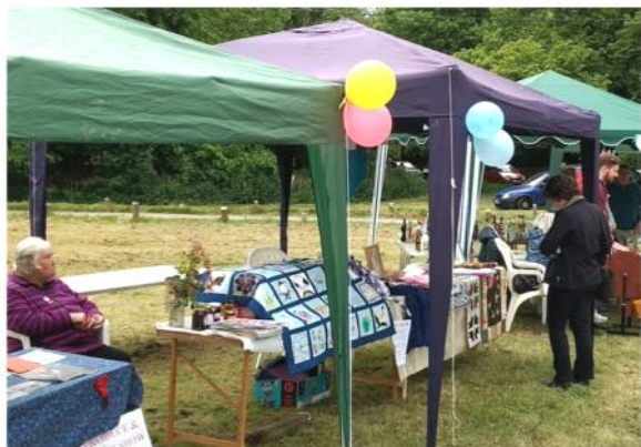
WI at the Sutton Courtenay Showcase.