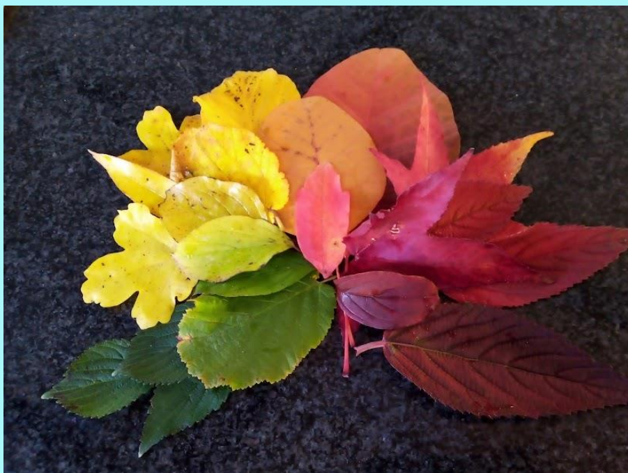
An Autumn Rainbow