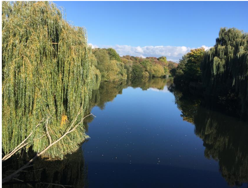
The Thames from Sutton Bridge